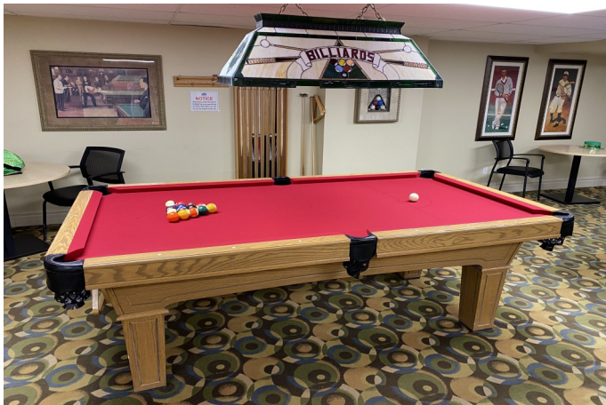
The new look of our Games Room Pool Table

If you have any questions, concerns, suggestions or comments regarding the HOA, the Lake Club and any of our activities, please send them directly to the Board of Directors at lakesatrrhoa@gmail.com .