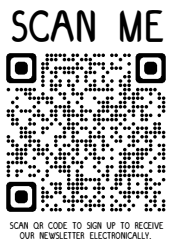
SCAN OR CODE TO SIGN UP TO RECEIVE OUR NEWSLETTER ELECTRONICALLY.

The Lake Club is located in the parkade level of The Manor Village at 450 Rocky Vista Gardens NW